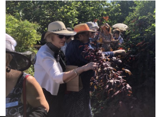
Above: Picking tea leaves used to make tea.