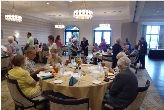
Dining Room at Heritage Palms