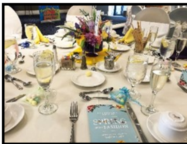
Table décor with centerpieces by Kitty Satterfield